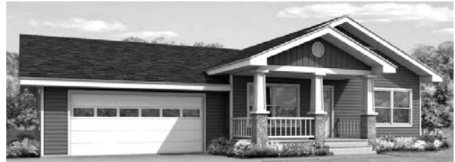
Rendering of Example Design